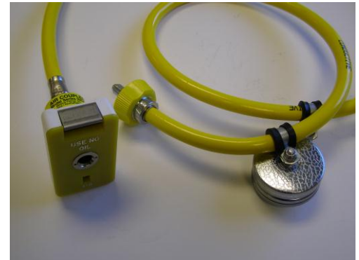
Hose Assembly & Retractor Kit