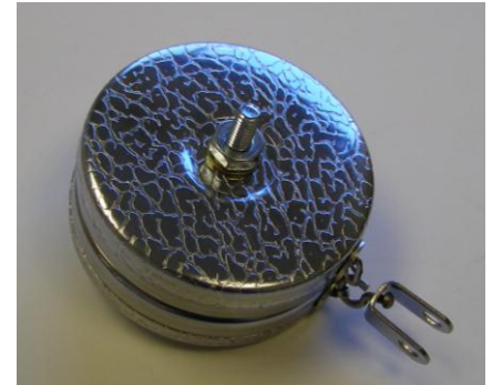
Dual Hose Retractor